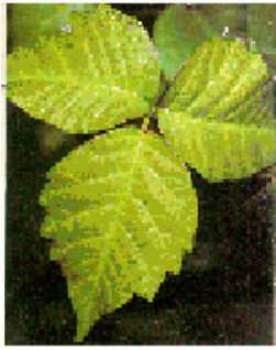
___ Shiny green