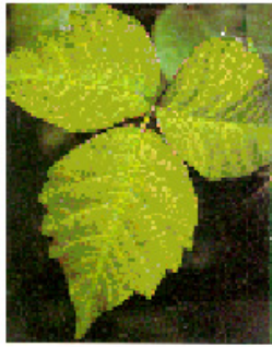
___ Dull green