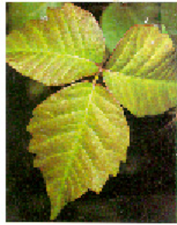
___ Shiny green with a reddish tinge