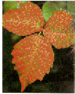
___ Mostly red with some green