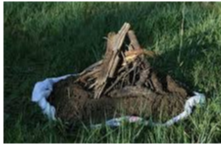
This is a "mound fire." If you do it right, you can take down the mound the next morning and leave no trace.